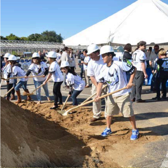
TABLE OF CONTENTS STRIDE Academy