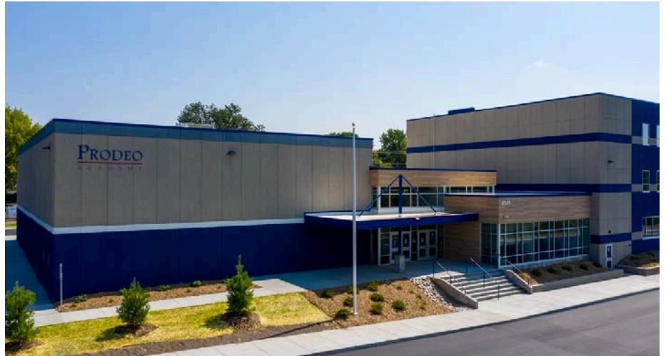
Prodeo Academy, completed July 2020